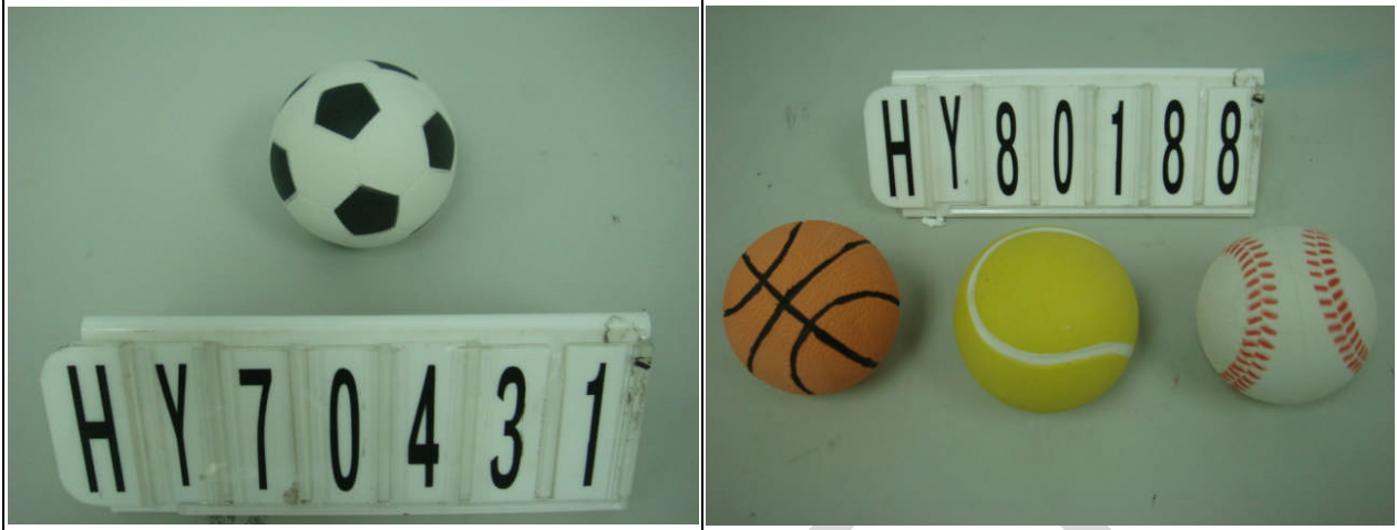
Sample picture (As received)