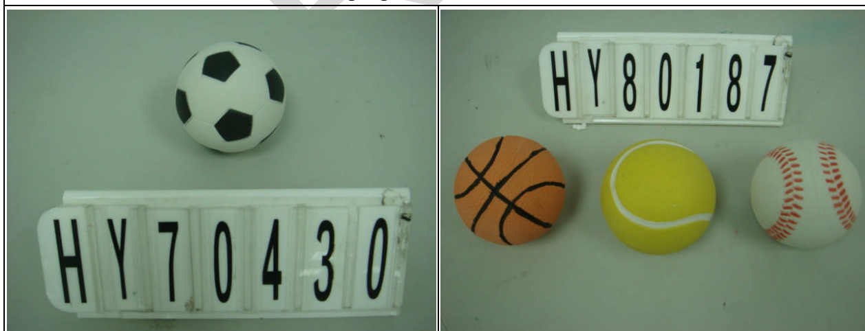
Sample picture (As received)